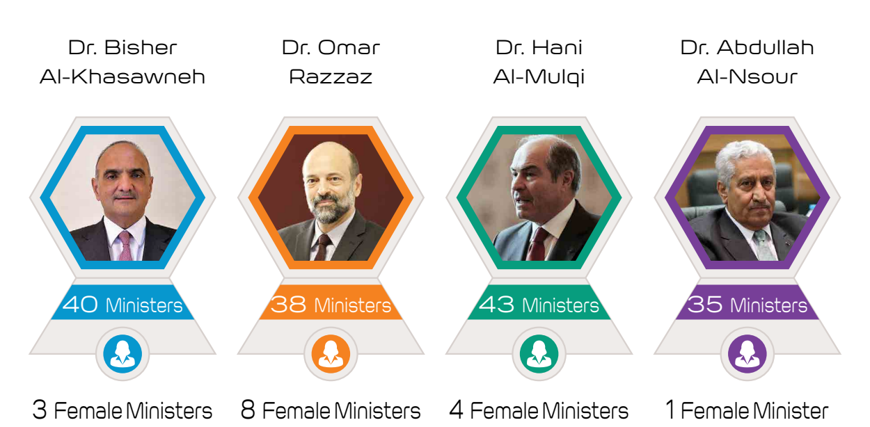
Figure (9): A comparison between Dr. Bishr Al-Khasawneh's government regarding the last three governments

Comparing Al-Khasawneh's government with the last three governments regarding the number of ministers forming the government is concerned, we find that Al-Khasawneh's government was formed from 40 ministers in its first version, with three reshuffles over a period of nine months. Thus, the number of ministers in the Al-Razzaz government over a period of nine months was 38 ministers, that of Al-Mulqi's government was 43 ministers, and Al-Nsour's government comprised 35 ministers in the first nine months. Furthermore, regarding the number of female ministers, Al-Khasawneh's government included three females, Al-Razzaz government included eight, Al-Mulqi's included four, and Al-Nsour's government included one female minister during the nine-month period.